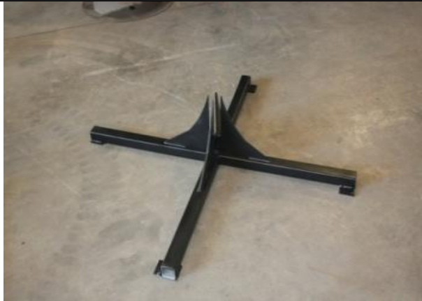
Step 1. Place base piece flat on ground.

Always inspect the targets before and after use for proper and safe operation. Do not use any targets if any damage or improper operation is found.