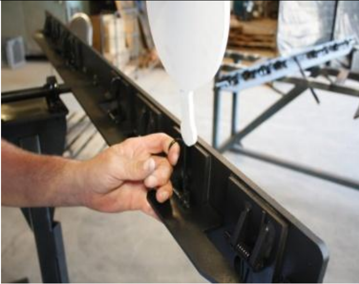
Step 5. Install target plates.