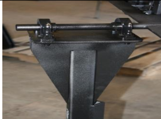
Step 4. Place rack and mount assembly onto upright piece, by using the marked white end of upright piece.