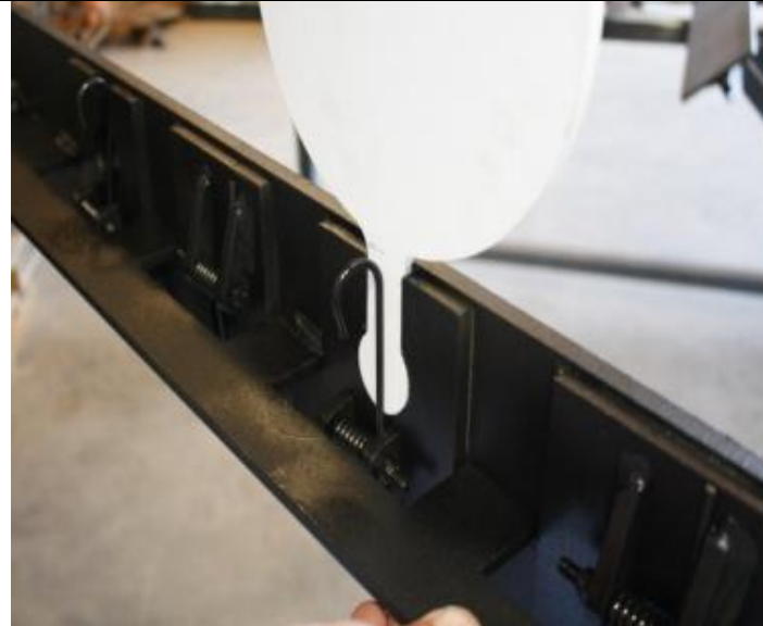
Step 6. Install weights on pegs.