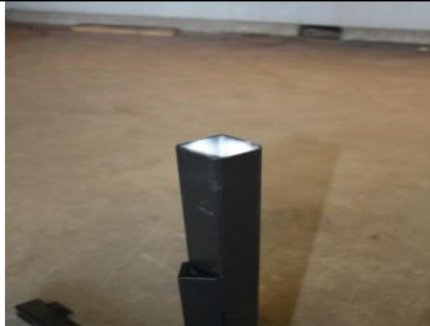
Step 3. Verify the white end of upright piece is facing up.