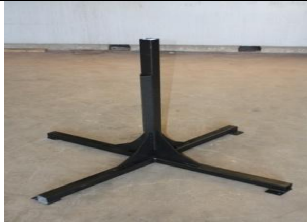
Step 2. Place upright piece into base piece.