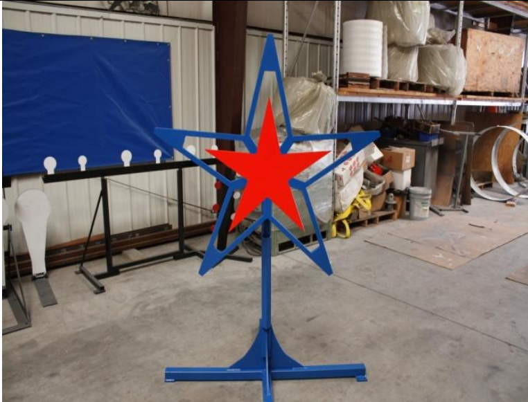
Step 4a. Assembly should appear as shown.