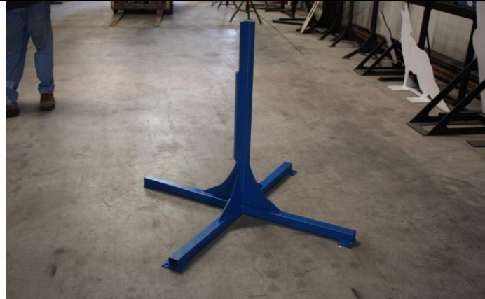
Step 2. Place upright piece into base piece.