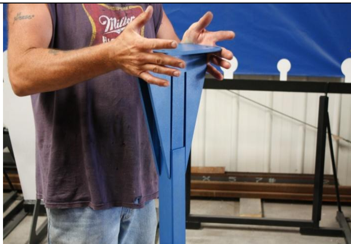
Step 3. Place top mount assembly onto upright piece.