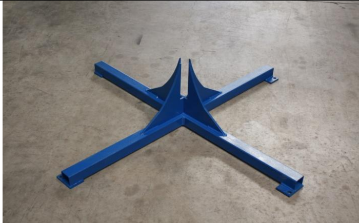
Step 1. Place base piece flat on ground.