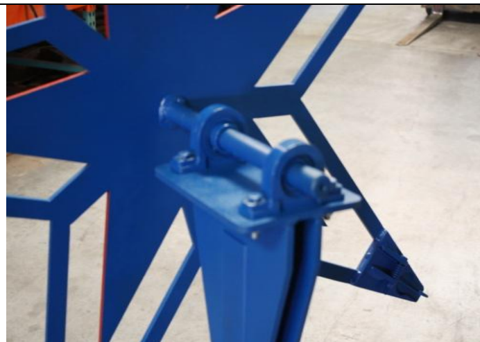
Step 4. Place shaft in bearings with star on same side as bullet splitter.