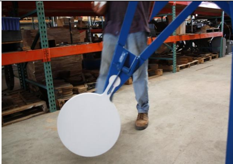
Step 5. Install the five (5) target plates into the spring retainers.